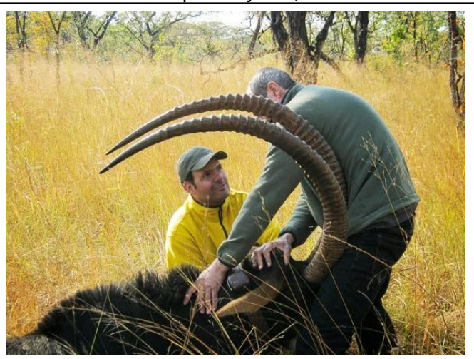
Setting a collar on a splendid bull

Then we returned and looked for the lion but we could never find him again. That's when we started to realize the gravity of the situation, We had an active sable predator on the loose around our most important herd! There is little doubt that the lion must have been there tracking down the sable for a meal. And chances are he's done it before and will do it again. This can be a real problem. The sable numbers are so desperately low, that all it takes is one lion killing one sable every few weeks, to