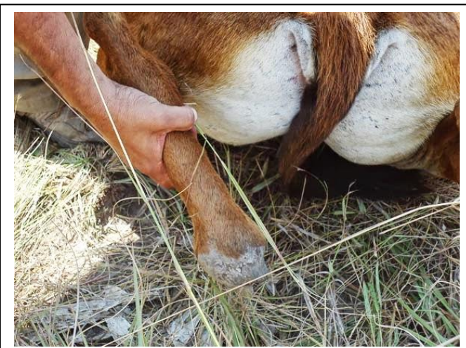
This cow lost part of her hind leg due to a snare injury

We also came face to face with several vivid examples of the effects of cable snares on sable. Two darted females had amputated legs. One was a four year old female with the right front leg amputated below the knee. The incident had probably happened 1 to 2 years ago and the injury had healed remarkably, but she has a serious limp, and has never produced a calf. The other was an older female which had the left hind leg amputated. In addition two of the bulls found were limping, and after being darted and inspected, they revealed serious injuries on their right hind legs, also clearly caused by