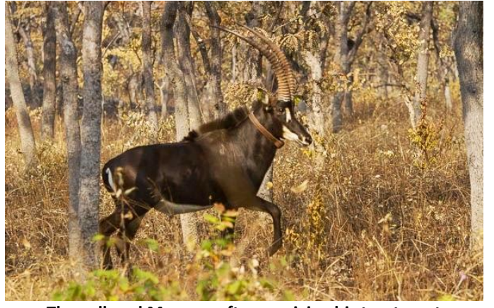
The collared Mercury after receiving his treatment

We started in Cangandala by tracking the animals on the ground and checking the trap camera records, however without encouraging results because of very atypical veld conditions. The unusually moist and prolonged wet season had delayed the grass decay and seasonal burnings. This was probably good for the animals, providing more cover, graze and water availability well into the dry season, but made our job at finding and observing sable much harder. In addition few sable used the salt