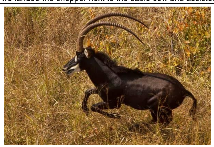
A magnificent bull tries to avoid the vet's dart

her on the ground. We inspected the three years old female which was well advanced on her first pregnancy! Surprisingly she had suffered only minor injuries, only scratches on the back and neck, and a superficial wound on the belly. There were no bite wounds, and the sable skin had proved to be quite resistant to the lion claws on his first wave of the assault. The belly wound was bleeding slightly and Pete, concerned that infection could set in cleaned the wound abundantly with water, disinfected it and treated the female with antibiotics. The female was then marked, collared and released. To improve her survival chances, we chased her a couple kilometers from the scene. In subsequent